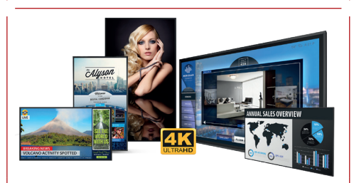
Planar Professional Large Format LCD Displays