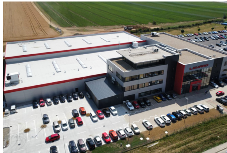
Leyard Europe Factory