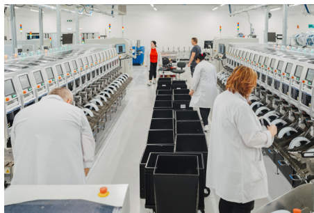
Leyard Europe Factory