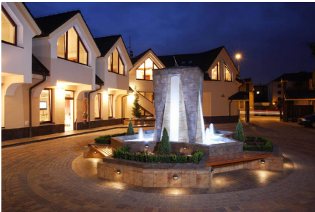
Hotel Enchante Presov