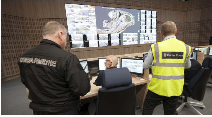
Eurotunnel Control Room Calais