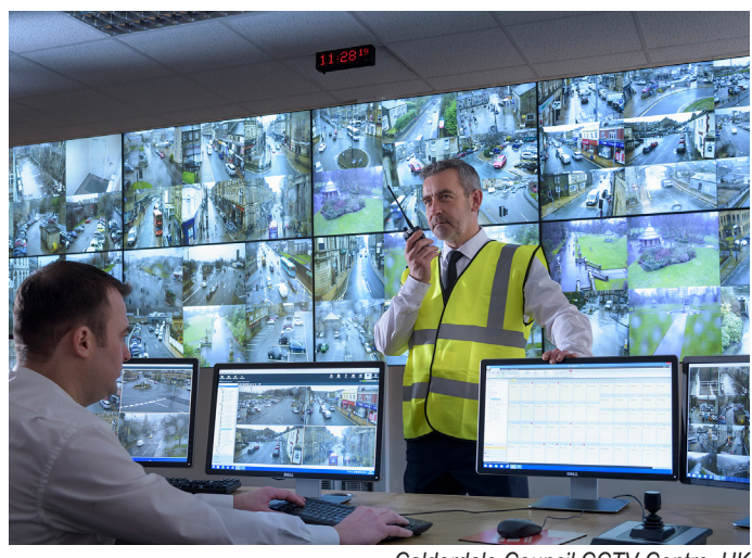
Calderdale Council CCTV Centre, UK