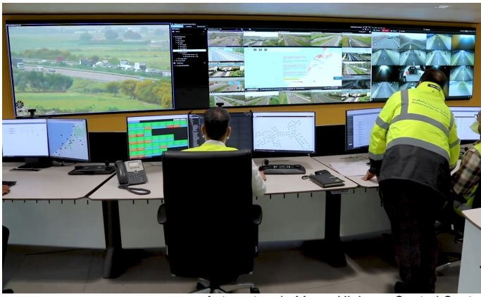
Autoroutes du Maroc Highway Control Centre