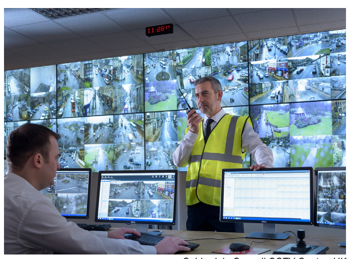
Calderdale Council CCTV Centre, UK